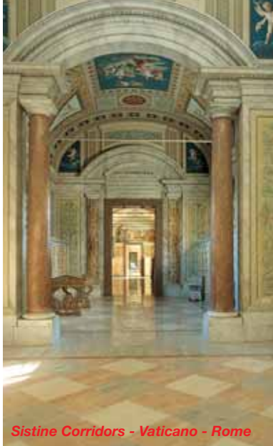
Sistine Corridors - Vaticano - Rome