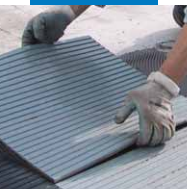
Laying dove tale-back rubber with Granirapid