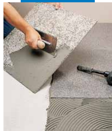
Laying synthetic flexible granite with Granirapid grey