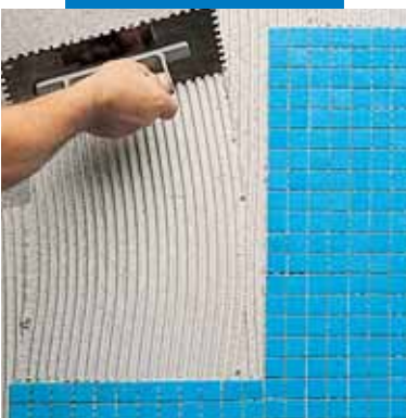
Laying vitreous mosaic with Granirapid white