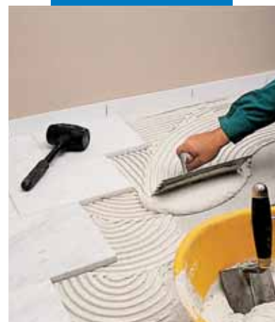
Laying white Carrara marble with Granirapid white