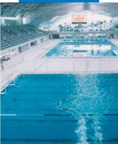
An example of an installation of mosaic and klinker in a swimming pool - Olympic Centre - Sydney (Australia)