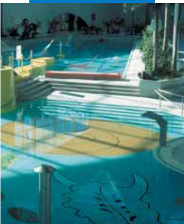
An example of an installation of mosaic and klinker in a swimming pool

All relevant references of the product are available upon request