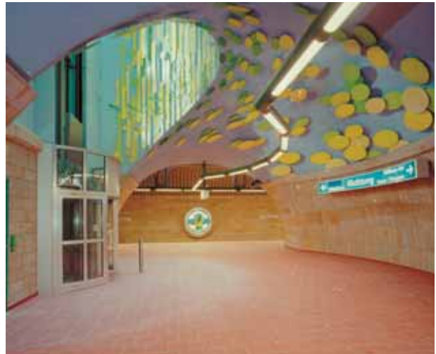
An example of an installation of granite with Granirapid - Subway in Mulheim Ruhr (Germany)

Granirapid grey: 30.5 kg packs. Part A: 25 kg bag; part B: 5.5 kg drum.