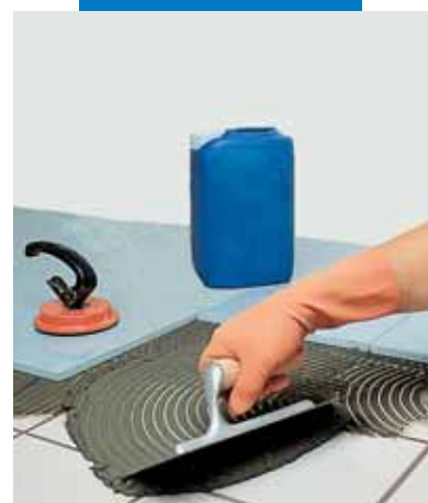
Laying agglomerate tiles over existing ceramic tiles with Granirapid grey