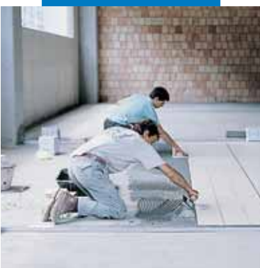
Laying porcelain tiles in a factory